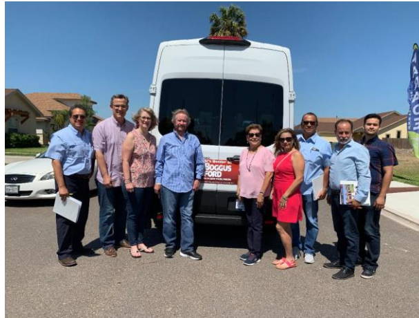
The day has arrived and the judges were out and about all day Saturday and Sunday taking in these beautiful homes. I’m sure they had hard decisions to make on the outcome of the winners.